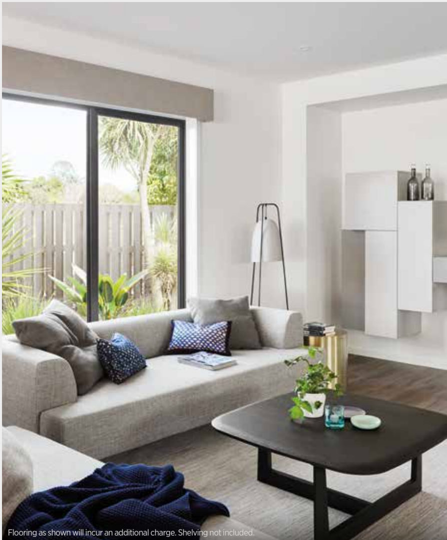
Flooring as shown will incur an additional charge. Shelving not included.