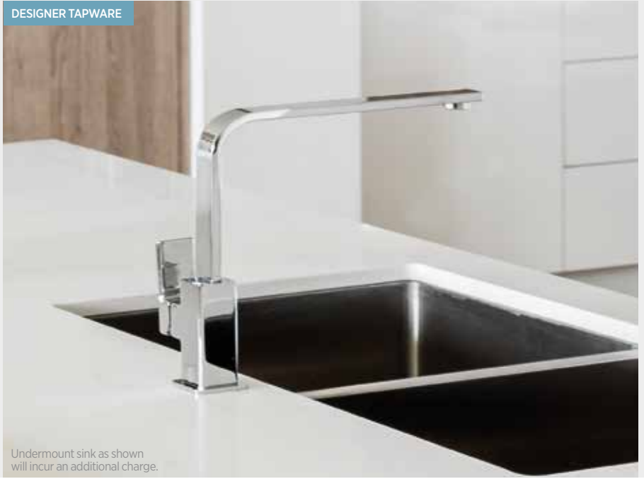
Undermount sink as shown will incur an additional charge.