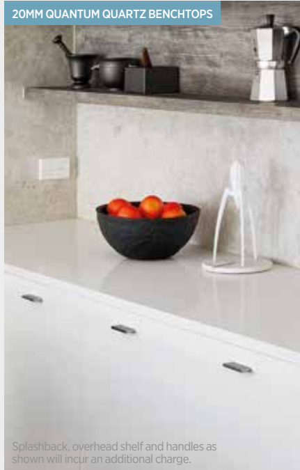
20MM QUANTUM QUARTZ BENCHTOPS

Splashback, overhead shelf and handles as shown will incur an additional charge.