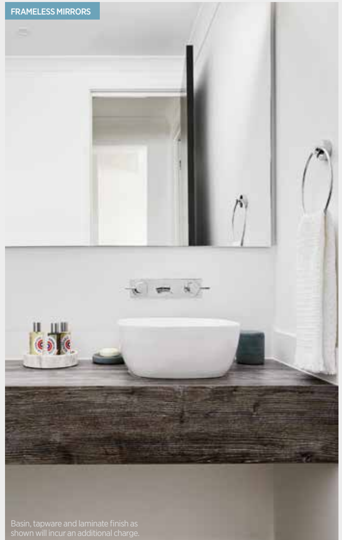
Basin, tapware and laminate finish as shown will incur an additional charge.