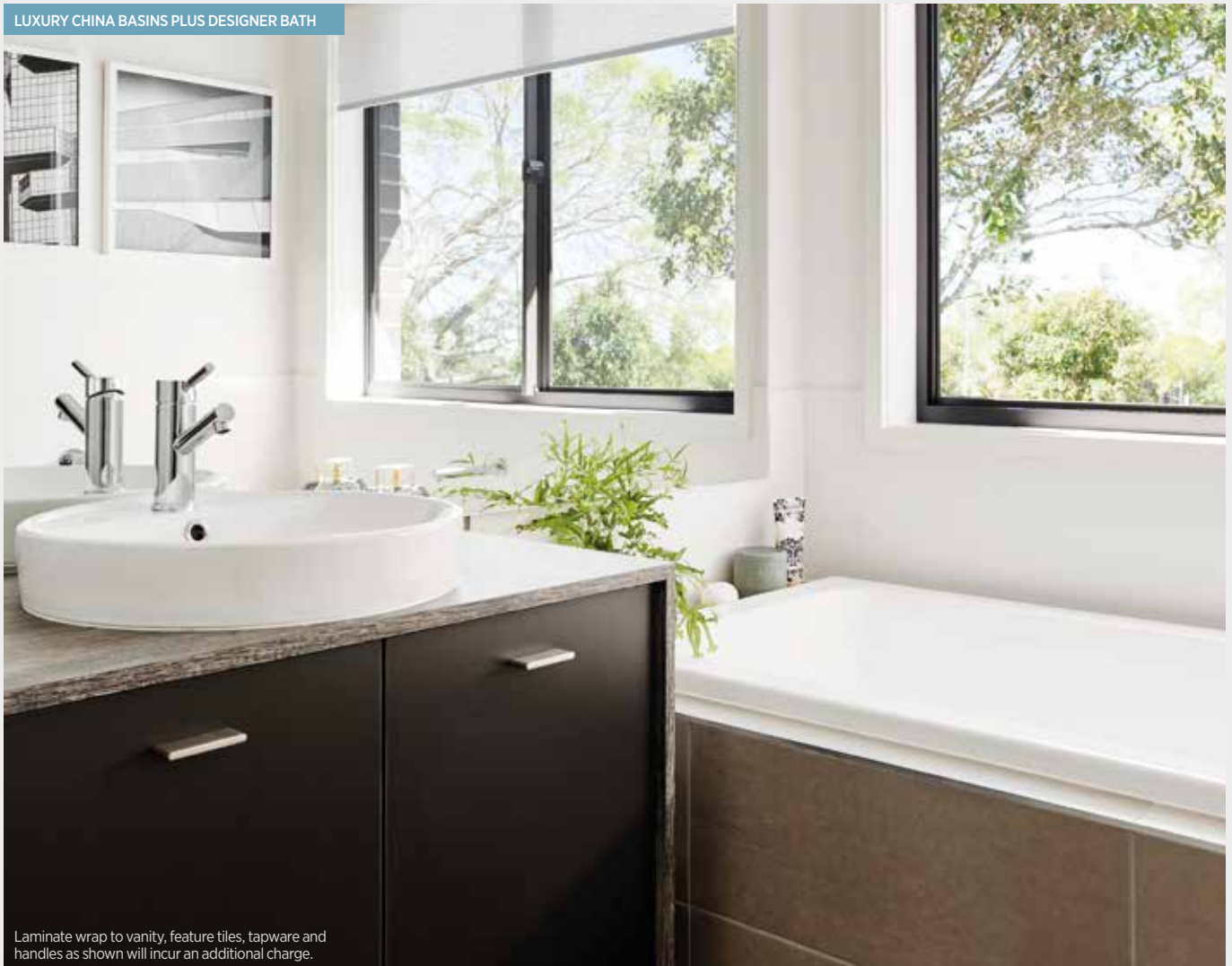
Laminate wrap to vanity, feature tiles, tapware and handles as shown will incur an additional charge.