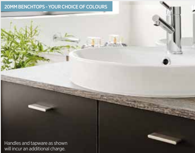
Handles and tapware as shown will incur an additional charge.