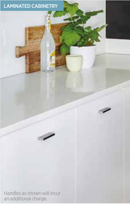
Handles as shown will incur an additional charge.