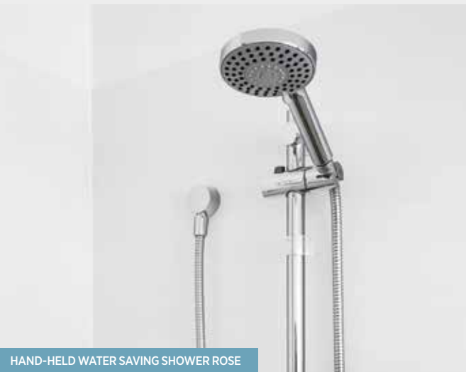
HAND-HELD WATER SAVING SHOWER ROSE